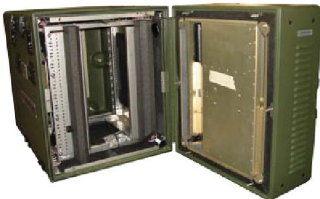
Image shows compressor air conditioning unit fitted into an insulated aluminum E-Rack.