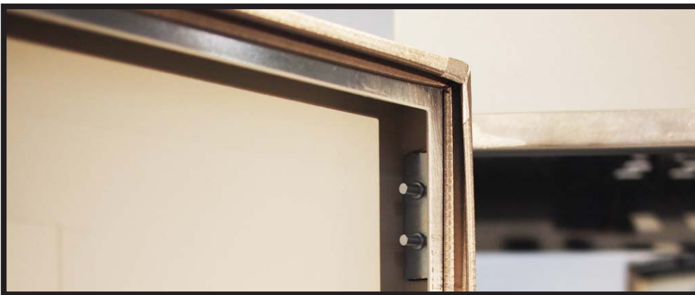
Figure 1: Photo of the cabinet enclosure going through the tin-plating process to improve electrical conductivity. The plating was applied with graphite probes as the enclosure was too large for a dip-bath.

The tin plating process has four main steps. The first is to etch the metal. The acid-based chemical primes the metal and prepares it for plating. Step two desmuts the metal. Step three is to apply the nickel plating. Step four is the application of the tin. Low voltage is applied to a covered graphite probe for each of the step of the process. A positive polarity is utilized for step 1 and 2 and negative polarity for steps 3 and 4. The enclosure is finished with various types of steel wool and other pads to remove any remaining barbs and residue while providing a keen shine. Figure 1 shows the cabinet after Step 4. With the core of the enclosure tin-plated for electrical continuity, the next step was looking at the covers and gasketing.