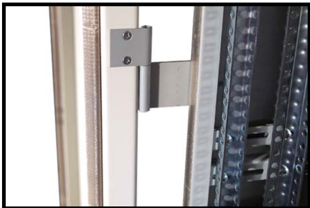
Front door hinge, inside.

Each cabinet enclosure application brings its own set of EMC challenges. There are several gasketing techniques to solve these problems including stamping directly into the sheet metal before bending, adding metal BeCu fingers or strips, or strip versions with wire meshed foam gaskets. Plating processes using conductive metals such as tin can also be highly effective. In other applications coatings can help provide electrical continuity to solve the problem. In applying these techniques, Optima EPS balances other factors such as cooling, weight, size constraints, and desired pricing points to meet our customer's goals.