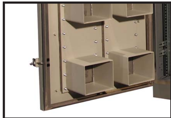
Interior rear filter.